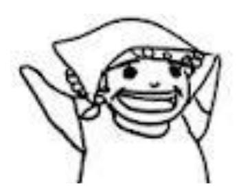
↑ Power of GAGA Logo

As reported in the February 2013 issue, Power of GAGA (GAGA = Mama) project started in September 2012. Since then, the members took training on how to create their own jobs and prepared to launch their own business. The membership has grown to 19 people. Finally, the members opened GAGA Tapestry (production and distribution of processed seafood) and GAGA-YA (meaning GAGA's shop: production and distribution of Tofu) on July 19th, 2013.